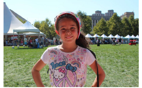
Little girl with Rusyn headpiece